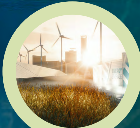
TRI 5: Integrated Regional Energy Systems