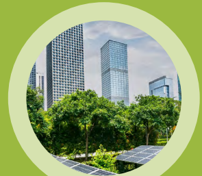
TRI 7: Integration in the Built Environment