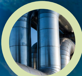
TRI 4: Efficient zero emission Heating and Cooling Solutions