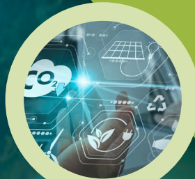
TRI 6: Integrated Industrial Energy Systems