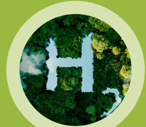
TRI 3: Enabling Climate Neutrality with Storage Technologies, Renewable Fuels and CCU/CCS