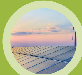
TRI 2: Enhanced zero emission Power Technologies