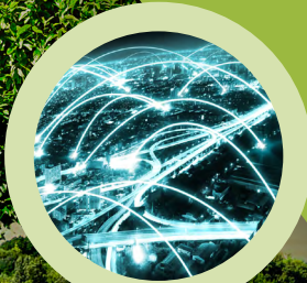
TRI 1: Integrated Net-zero-emissions Energy System

Implementing accompanying activities on knowledge management and maximising impact